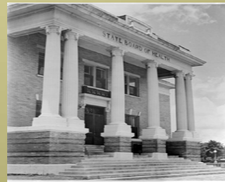
1911 State Board of Health, Jacksonville, FL