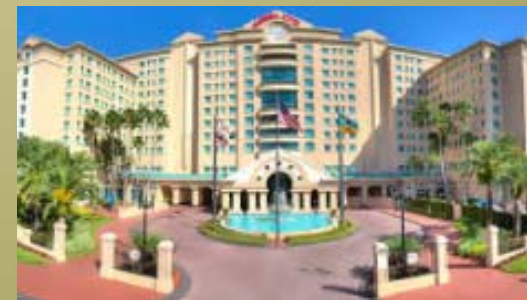
The Florida Hotel, Orlando, FL