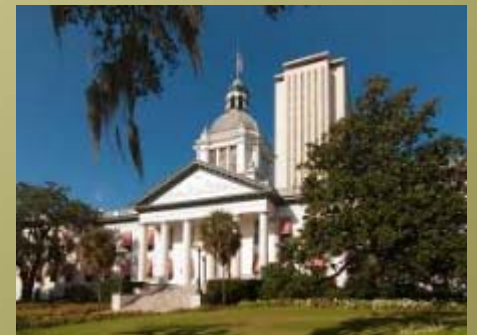
State Capital Building, Tallahassee, FL