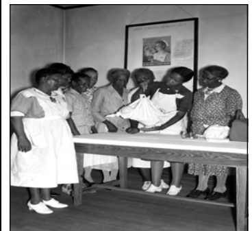
Teaching Midwives....