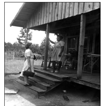
PHN Makes Home Visit